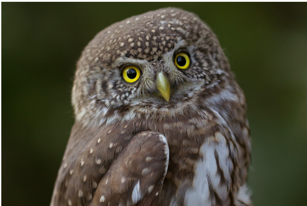
Sparrow owl (photo - Andris Soms)

4. Departure by boat on the Gauja River from the Lygatne ferry down the river to the place where the Brasla River flows into the Gauja. Length - 10 km, duration - 2 hours. Target bird species: Black-throated Woodpecker, White-backed Woodpecker, Gallic, Shore Plover, Great-toothed Woodpecker, Nuthatch, Lesser Pied Woodpecker, Long-tailed Tit, Northern Gray Tit, etc.