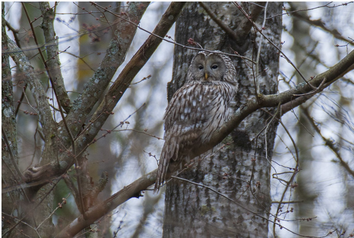
Ural owl

In addition to forest birds, species of sparrow birds uncommon in Western Europe can be found on the shores of rivers and lakes, such as the river warbler and the garden reed, the shorebirds live, and in the meadows you can still hear squeals.